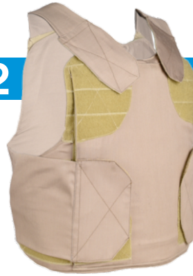
Duke Concealed Vest