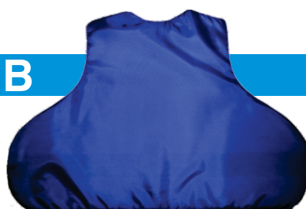
Level II Wide - Protect against 9mm (124gr.) and .357Mag (158gr)