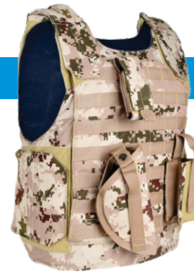
Duke Premium Vest