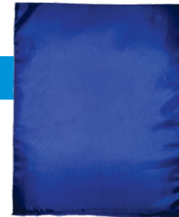
Level IIIA Square - Protect against 9mm (124gr.) and .44 Mag (158gr)