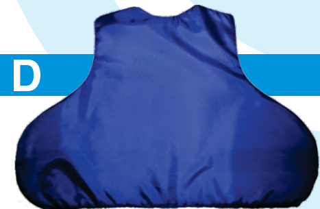
Level IIIA Wide - Protect against 9mm (124gr.) and .44 Mag (158gr)