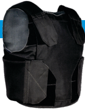
Duke Standard Square / Wide Vest