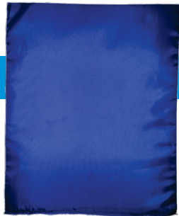
Level II Square - Protect against 9mm (124gr.) and .357Mag (158gr)