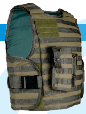
Duke Executive Vest